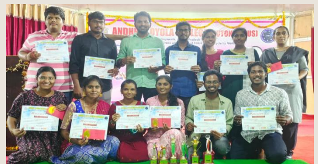
MBA Previous students participated in a Management meet ‘ MAGNALITE 2K22 ’ conducted by Andhra Loyola College during 6 th – 7 th September 2022 and won the Overall Championship.